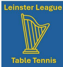
Leinster Table Tennis League